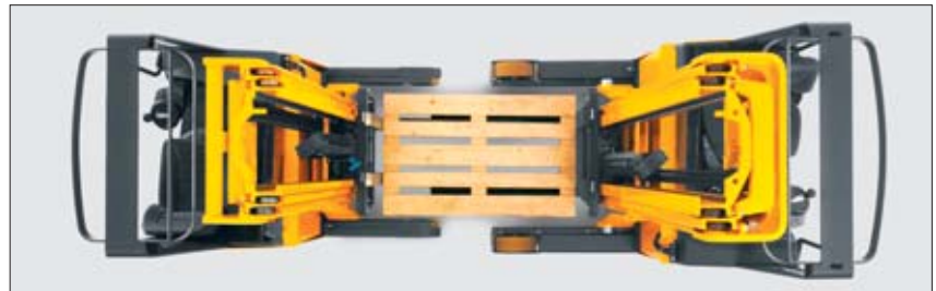
The correct chassis for every application