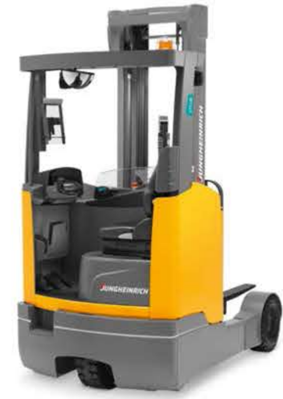
Up to 2,000 kg capacity Up to 7,400 mm lift height