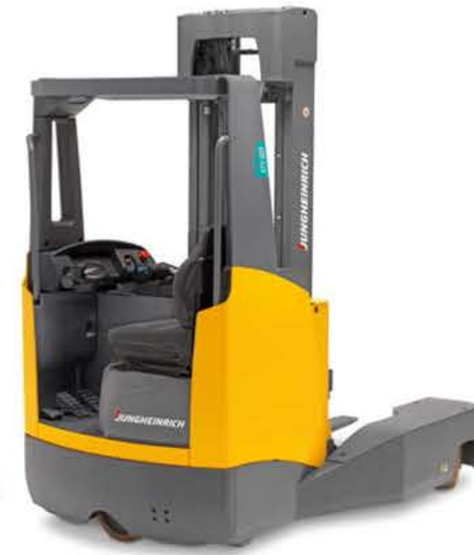
Up to 2,500 kg capacity Up to 10,700 mm lift height