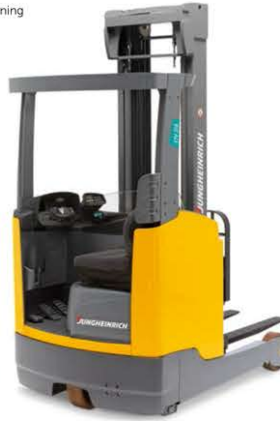
Up to 1,600 kg capacity Up to 10,700 mm lift height