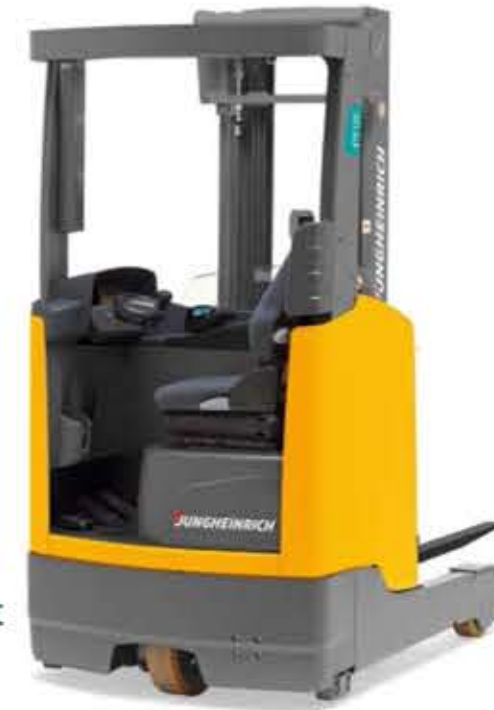
Up to 1,200 kg capacity Up to 7,100 mm lift height