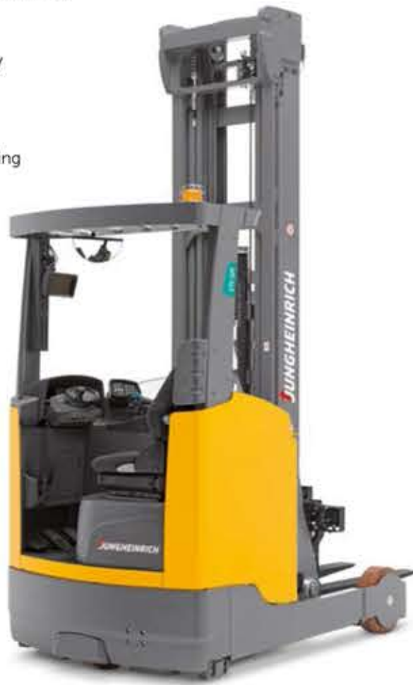
Up to 2,500 kg capacity Up to 13,000 mm lift height